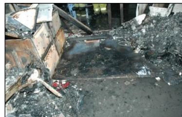
IGA fire, Home Hill QLD