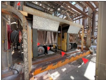
Yarwun Alumina Refinery