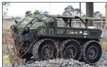
Defence logistic vehicle* *image changed due to a confidentiality agreement