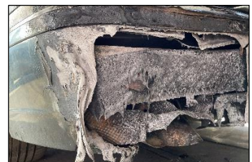
BMW Car, Foxy Wholesale Cars