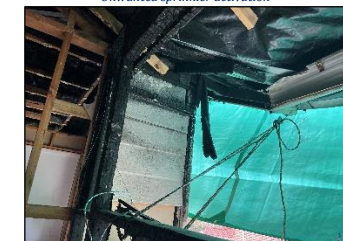
150 Albany Creek Road QLD