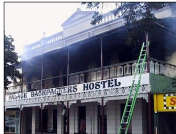
Childers Hotel backpackers fire