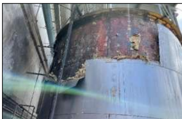
Tallow Tank fire, Teys Australia