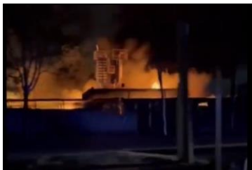
Cleanaway Bohle Liquid Waste Services