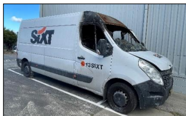
Sixth Renault Master III vehicle