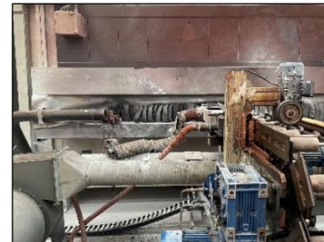
Knotwood Industry Stayplton QLD